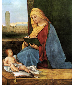
The Reading Madonna Giorgio Barbarelli da Castelfranco