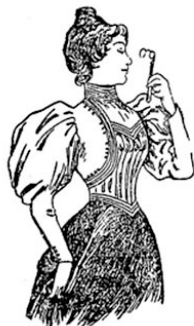
THE SELFISHNESS OF MEN.

Illustrated 1898 column by Dorothy Dix, The Picayune, New Orleans