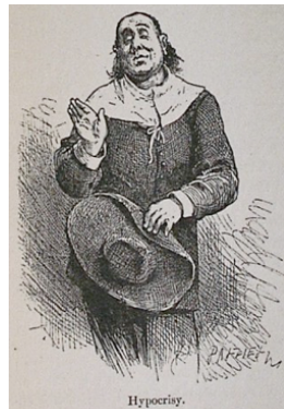
Hypocrisy John Bunyan's Pilgrim's Progress, 1890