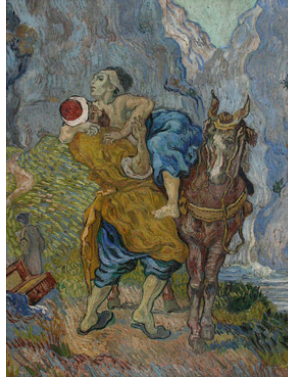
The good samaritan Vincent van Gogh, 1890