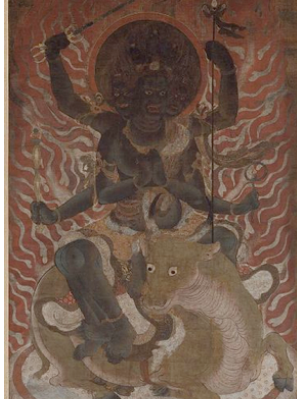
Daitoku myoo, the Wisdom King of Great Awe-inspiring Power, 11th century.

Pojman & Fieser, Ethics: Discovering Right and Wrong