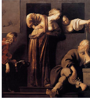
Xantippe Dousing Socrates alt. title: Socrates, his two spouses, and Alcibiades Reyer Jacobsz van Blommendael, 1655