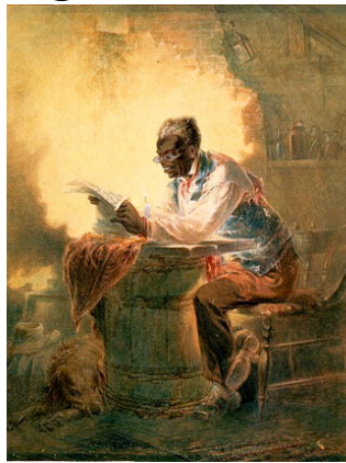
Black man reading newspaper by candlelight. Man reading newspaper with headline, "Presidential Proclamation, Slavery," which refers to the Jan. 1863 Emancipation Proclamation Henry Louis Stephens, 1863

Pojman & Fieser, (2009) Ethics: Discovering Right and Wrong. pp. 170 - 187