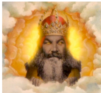
God (animated photograph of 19th century English cricketer WG Grace) Monty Python and the Holy Grail