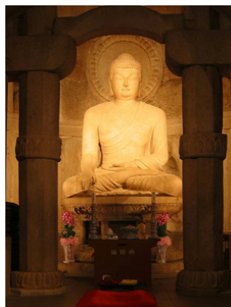
Buddha at Seokguram in South Korea, World Heritage Site