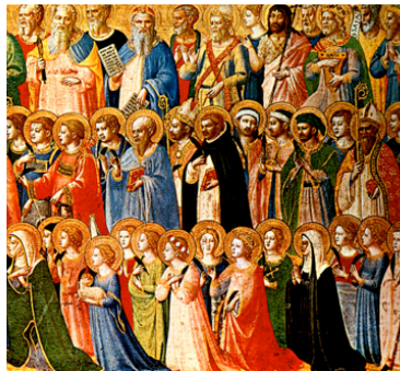
Communion of Saints