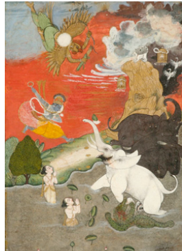
Vishnu Saving the Elephant Unknown Artist, mid 18th century