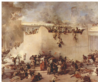
The destruction of the Temple of Jerusalem Francesco Hayez, 1867