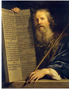
Moses with the Ten Commandments Phillippe de Champaigne, 1648