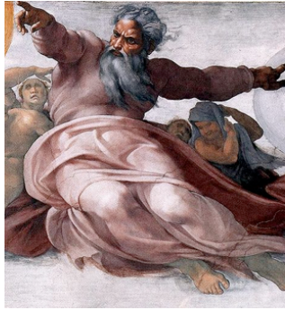
Creation of the Sun, Moon, and Planets Michelangelo Buonarroti, 1511