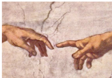
The Creation of Adam Michelangelo Buonarroti, 1508 - 1512