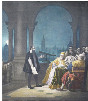
Galileo Galilei displaying his telescope to Leonardo Donato 19th century