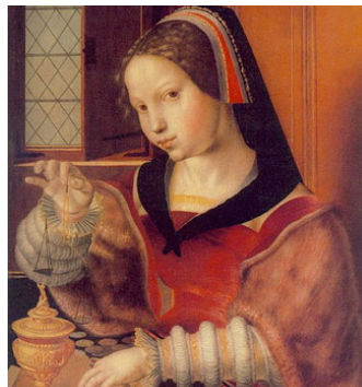
Woman Weighing Gold Jan van Hemessen, c1530