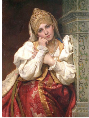
Bojar Woman Firs Sergeevich Zhuravlev, 1896