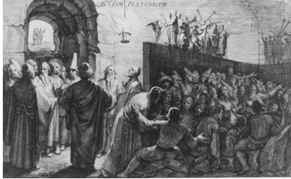
Plato's Allegory of the cave Jan Saenredam, 1604