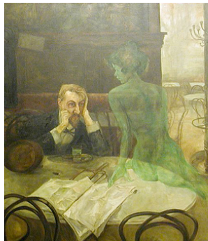
The Absinthe Drinker Viktor Oliva, 1901