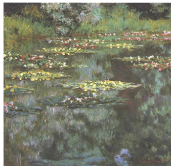
Waterlilies pond Claude Monet, 1904