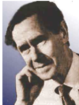
J.L. Mackie Proponent of Moral Skepticism Ethics: Inventing Right and Wrong