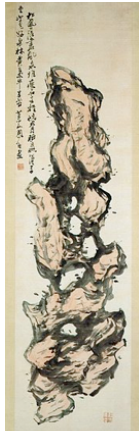
Strange Rock Chou Y'ang, 19th century