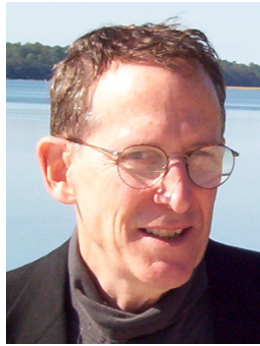
Gilbert Harman The Nature of Reality