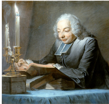
The Abbé Jean-Jacques Huber Reading (1699 –1747) Maurice Quentin de La Tour, c.1742

Pojman & Fieser, (2009) Ethics: Discovering Right and Wrong. pp. 209-223