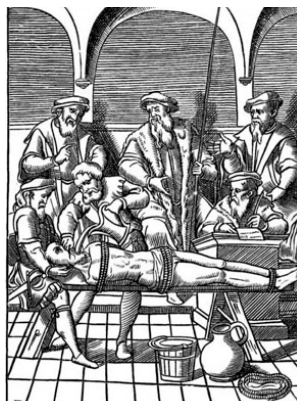
Water Torture J. Damhoudere, 1556